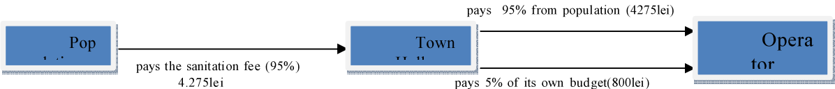
Figure 2- cash flow before accession in ADID

Jebel has a population of 5000 inhabitants, a number of 1500 homes and is located at a distance of 20 km from Timișoara. Before becoming a member of the Intercommunity Development Association for Waste Management of Timis County, the Jebel local council outsourced the sanitation service of the locality by contract with direct award. The town hall as contracting authority would pay the service provided by the operator, levying a sanitation tax from the population in amount of 3 RON / household / month. The tax collection rate was 95% and in this manner the Town hall was collecting monthly from the population the amount of 4,275 RON. In the end, the Town hall was sustaining additionally from its own budget the money difference up to the amount of 5,000 RON / month, approximatively 700 - 800 RON / month. I must emphasise the fact that the sanitation operator did not have to make investments in collection equipment, all being provided by the Town hall (120 L waste bins, one for each household).